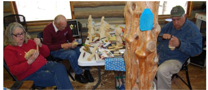
Everyone stayed busy and the floor filled with piles of wood chips.