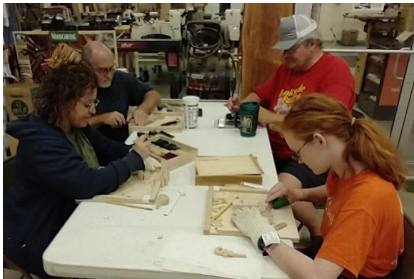
New faces at the Woodcraft carve-in