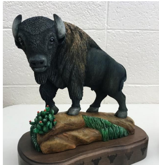
Fred Self shared a finely carved and painted bison, as well as a bark carving of a mountain man.