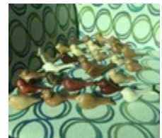
The flock and one.