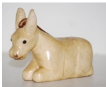
Did not sign in – For Manger Scene