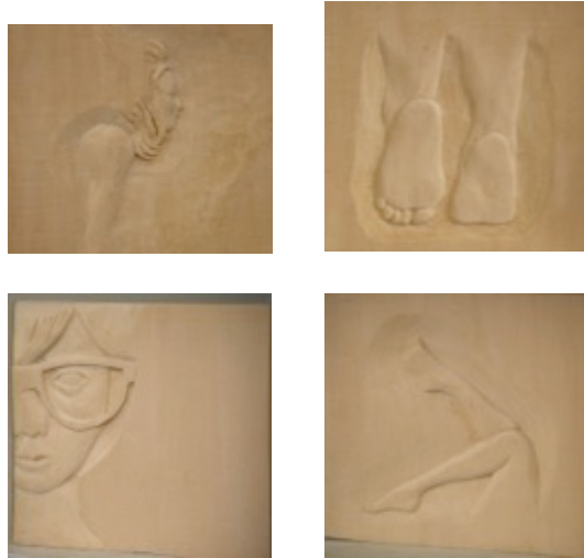
Pete Zachry – Four (4) Practice Low Relief Boards