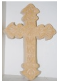
Pat Priest – Chip Carved Cross