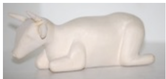
Did not sign – For Manger Scene