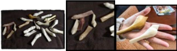
2 Flocks and Dedicated for Children